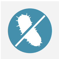
Maximum hygiene: controls biofilm