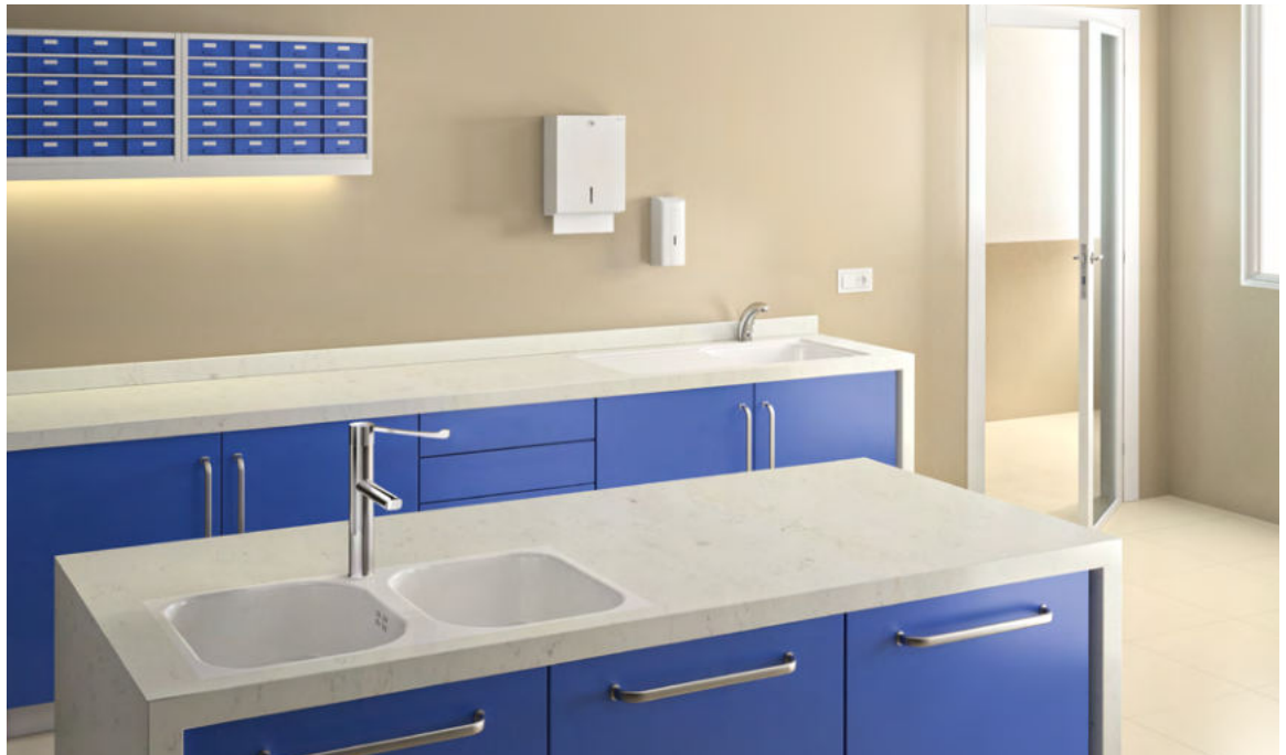
DELABIE ref.: 2664T1

Designed for healthcare facilities, DELABIE would like to present its new 2664T1 sequential mixer. It combines hygiene and safety, reduces bacterial proliferation, prevents the risk of scalding, and allows thermal shocks without shutting off the cold water. And, thanks to the sequential cartridge, it is simple to operate.