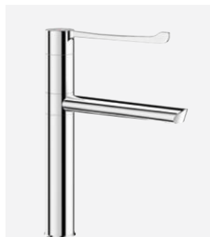
Swivelling spout H. 200 L. 200 DELABIE ref.: 2664T5