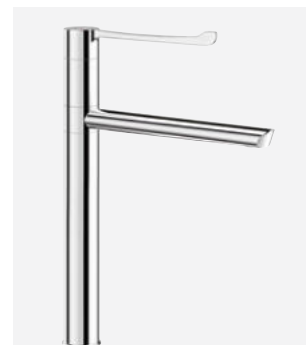
Swivelling spout H. 300 L. 250 DELABIE ref.: 2664T4