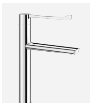
Fixed spout H. 200 L. 200 DELABIE ref.: 2665T5