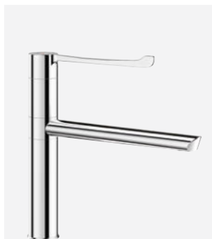
Swivelling spout H. 160 L. 250 DELABIE ref.: 2664T2

Images available on our website delabie.co.uk , in the Press section