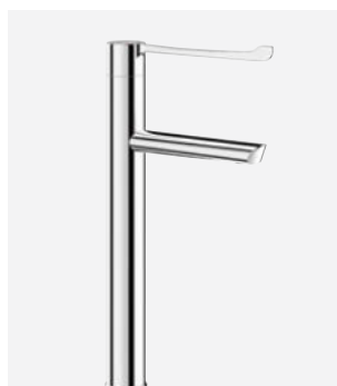
Fixed spout H. 300 L. 160 DELABIE ref.: 2665T3