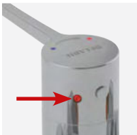
Thermal shock without removing the lever