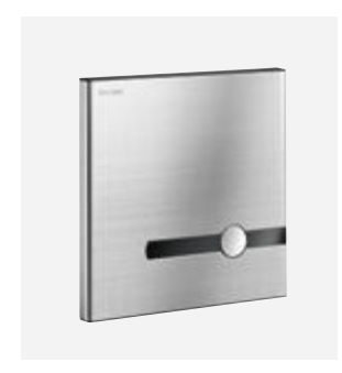
TEMPOMATIC dual control Ref. DELABIE: 464SBOX-464000 or 464PBOX-464006