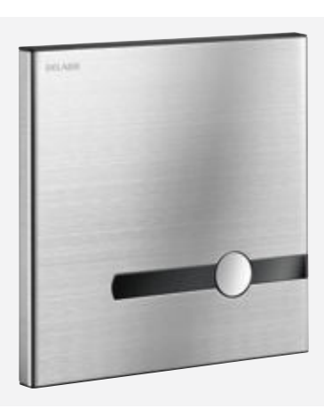
Ref. DELABIE: 464SBOX-464000

The TEMPOMATIC dual WC valve features an innovative recessing housing, patented by DELABIE. It adapts to all types of installation and can be installed on walls from 10 - 120mm thick. Its resolutely modern wall plate combines design and vandal-resistance. It has an "intelligent" rinsing system.