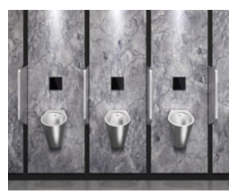
Installation example, TEMPOMATIC 4 recessed urinal with wall plate in black vitro-ceramic glass