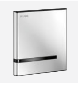
Satin finish stainless steel Ref. DELABIE: 430006 or 430000

Chrome-plated finish stainless steel Ref. DELABIE: 430016 or 430010