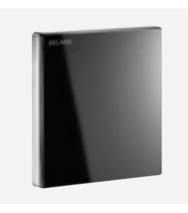
Black glass finish Ref. DELABIE: 430036 or 430030