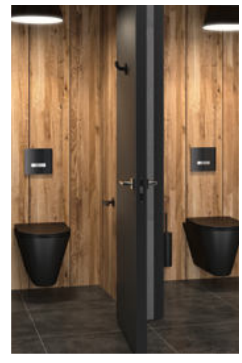
Installation example Ref. DELABIE: WC TEMPOFLUX 3