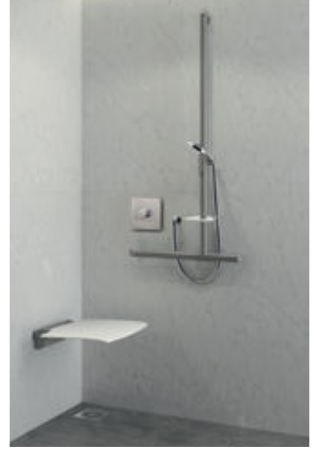
Lifestyle image: shower with H9631 mixer Ref. DELABIE: DOUCHE H9631