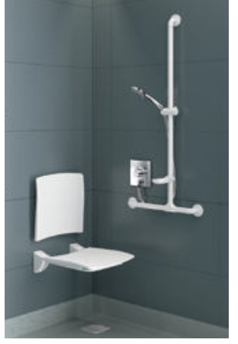
Lifestyle image: shower with H9633 mixer Ref. DELABIE: DOUCHE HÉBERGEMENT H9633