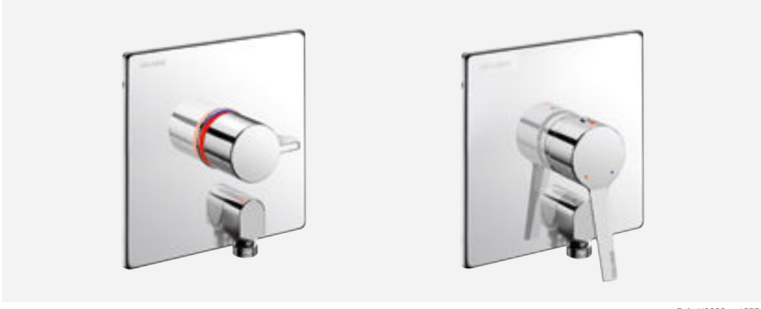
Refs. H9633 and 2551

DELABIE has redesigned its recessed shower mixers by equipping them with a new 100% waterproof recessing housing. This innovative system adapts to multiple installation configurations. They are designed to contribute to patient safety, the prevention of nosocomial infections and to general comfort.