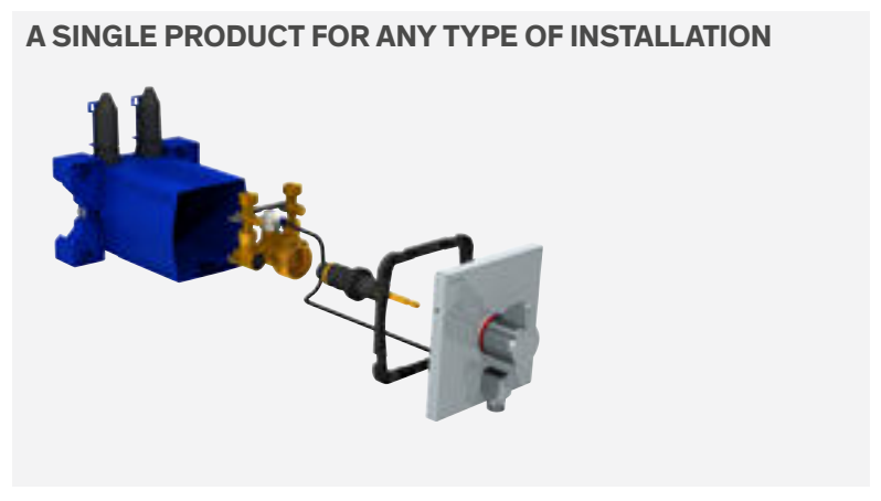
Recessed shower mixer Ref. DELABIE: H96CBOX + H9633