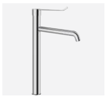
Mechanical sink mixer with swivelling spout Ref. DELABIE: 2564T4