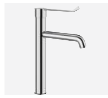
Mechanical basin mixer with pressure balancing and fixed spout Ref. DELABIE: 2565T5EP