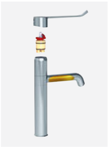
Mechanical basin mixer with swivelling spout Ref. DELABIE: 2564T1