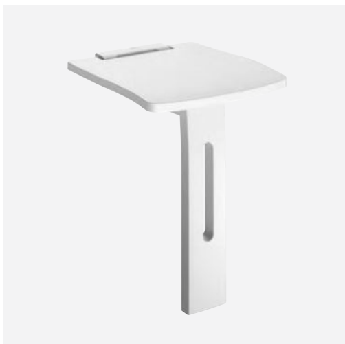
BASIC + shower seat Ref. DELABIE: 510405

Images available on our website delabie.co.uk , in the PRESS section