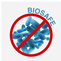
Hygiene and infection control

The mechanical basin mixer that doesn't compromise on hygiene