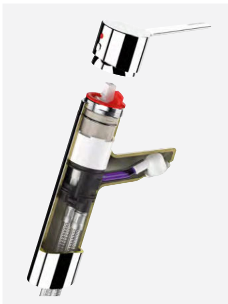
2921TEP cut-away: low water volume, pressure-balancing technology, thermal shock feature DELABIE Ref.: Coupe3D_2921TEP