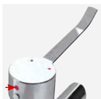
Thermal shock feature