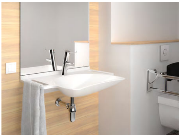
Pressure-balancing mechanical mixer DELABIE Ref.: 2921LEP

Images available on our website delabie.co.uk , in the Press section