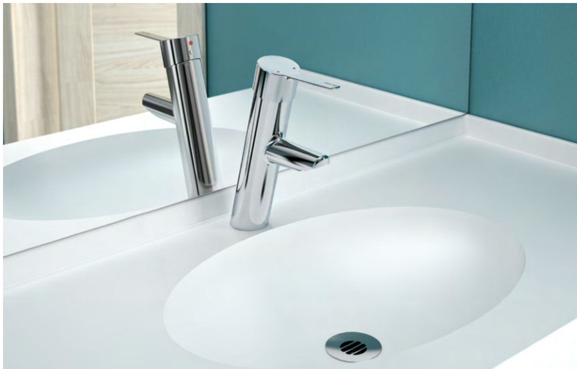
DELABIE Ref: 2921TEP

Discover the 2921TEP mechanical mixer, your new ally for impeccable hygiene and optimal anti-scalding safety, even in the most demanding healthcare environments!